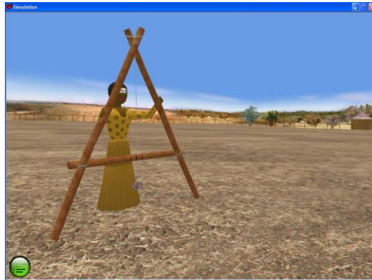
Surveying a field using an A-Frame (soil conservation)