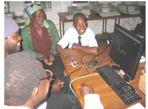
Bee-Keeping workshop, Rusike, Zimbabwe