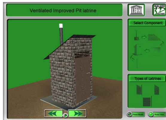
Building a VIP latrine (Mozambique, Zimbabwe)

i3dlo's - can be used to communicate concepts and develop skills in a wide range of skills areas, for example: