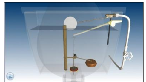
Water conservation: simple repairs to a toilet cistern