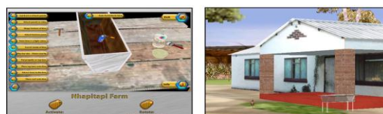
Bee-keeping – making a Kenya Top bar Hive & hive location