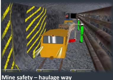
Mine safety – haulage way